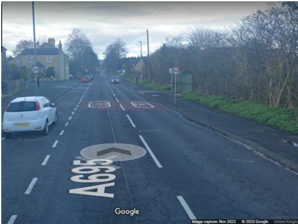
Google street view image of start of 20mph on Woodlands, Hexham

In addition, a set of SLOW road markings are provided on the approach to the 20mph speed limit at a location approximately 45 metres west of the junction with Hillside Road as shown in the following image.