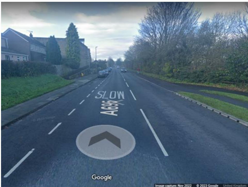
Google street view image of existing SLOW road marking on A695 on approach to 20mph speed limit

In addition, a set of SLOW road markings are provided on the approach to the 20mph speed limit at a location approximately 45 metres west of the junction with Hillside Road as shown in the following image.